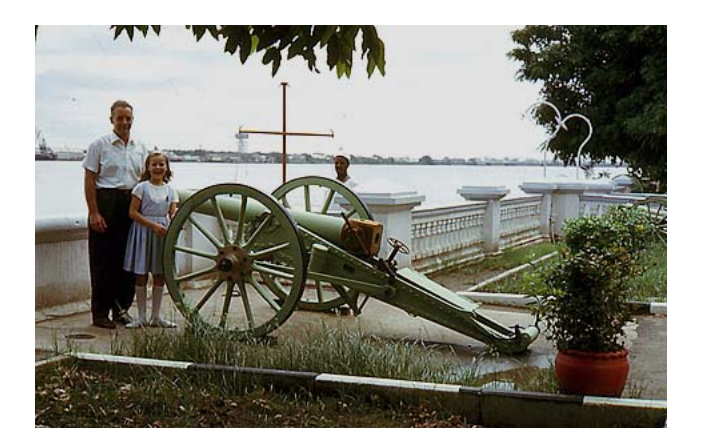
A canon pointing north over the Blue Nile in front of the President's Palace

We had to visit the Yugoslav club soon after our return. Friends told us that our absence at the New Year's party had been noticed that gave a perfect matter for gossipers there. One of the main issue was how could we afford the expenses for an 8-day trip to Kenya. There was a lot of loathsome envy involved so the best way for us was to keep absolutely quiet about the real reasons. I suggested showing the safari slides in the Club once I got them back from the developer in Europe knowing that this procedure would rather a long time. The problems with developed slides turned out to become complicated as to frame them in prior to be show to the audience. A slide had to be fixed between two glass mini-panes in a frame that process represented a nerve-racking task due permanent dust suspended in the air. An electrostatic charge through the rubbing cloth made it unlikely that there would not be any dust speck between panes. It was just to become the "task impossible"!