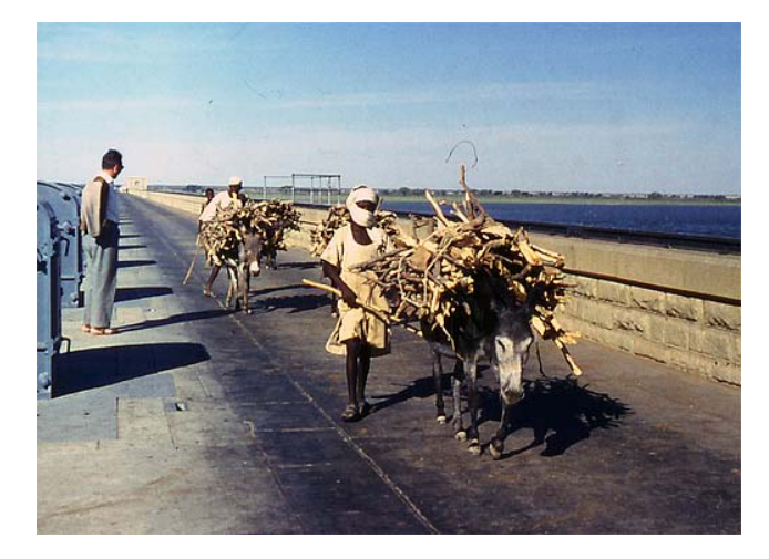
The causeway over the Gebel Aulia dam on White Nile used for water level control and for an adjacent hydroelectric power plant

him a 5-day leave for the Ramadan Bairam as the bus ride lasted about 24 hours. The dam wide overspill offered a good place for fishermen who would catch some large fishes like Nile tilapia or perch here. There were not many more interesting sites to visit in the surrounding of Khartoum hence we went often to Mogrem that is the confluence of Blue and White Niles. At the end of White Nile formed a wide and long clayey sand island that was visible at low water levels only. The soil was used for cultivation during dry seasons that last about 7-8 months. The bridge from Khartoum City to Omdurman crossed over that island and one could looked down at neatly arranged plots with hard working farmers as they tended their vegetables growing well and fast on this island of river deposit.