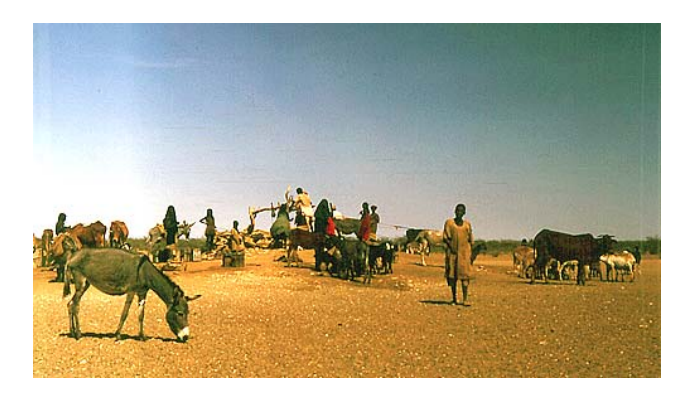
A water hole in the wasteland north of the Khartoum

In retrospect I believe that our first trip to Kenya had changed our stance and view on the continuation of living in Khartoum. The sense of safari made us to explore the countryside around Khartoum although there was not much to see about. The January 1964 was quite cool so we drove to Khartoum North and further into the desert. Driving through the desert was not too bad except for the very dry air drift through open windows. From distance we noticed a small mount with some movements around it. Soon we approached a deep well where local people got hold of water for their households. We found several people with camels and donkeys burdened with skin-bags to be filled with water. On top of a sand knoll stood gallows-like support holding a pulley for a long rope for a big bucket to reach into the deep well. The other rope's end was tied to a camel's harness with the animal walking to and fro from the well to pull out the bucket full of water. The bucket was then emptied in a trough for animals to drink or filled into pails used to fill skin-bags of waiting villagers. After a short chit-chat with bystanders we decided to return to our "civilization" feeling sorry for the camel unending slow walk to and fro from the well.