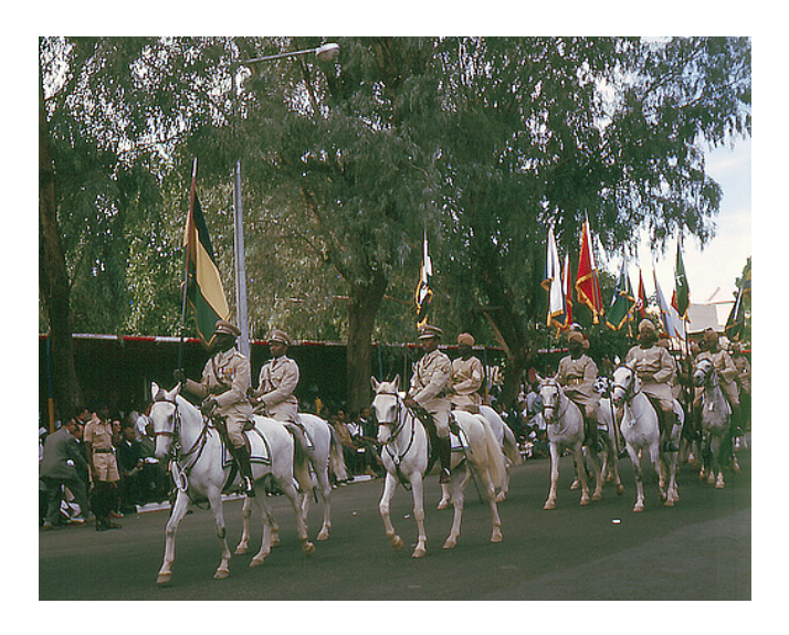
The Head of the Parade on the Republic's Anniversary on 17th November 1962

would never got any digestive problems with the stuff bought on the souk throughout all times of our stay in Khartoum.