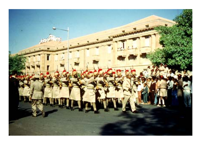
An infantry column in the Parade of Republic's Anniversary in front of the Main Post Office

My students succumbed to their bitter destiny having me as the lecturer in the two of 6th and 7th (final) classes respectively. They came up with few more complains about their home-works and tests that I had requested. I thought that it could be simpler and visibly better for them if I demonstrate certain problems using the graphical method. However soon I had found out that the graphical method is not suitable when working with Imperial unit system where 12 inches make a foot or with weight (force) units etc. The only way to it would be using the decimal system by taking say an inch or a pound as the basis. I got the habit to vary units between inches or yards and pounds or tones as the measures in the examples. Thus I forced on the students to learn how to convert given measures first in the certain basic units and then go on with working out an example. Thus they did discover the advantage of using the decimal system that origin goes back to few Arabic scientists. That made them happy and a little bit more understandable of my way of teaching – at last they had started THINKING and how to use their minds as to the proper engineer's way.