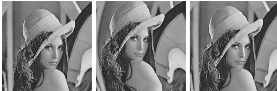
(a) Augmented Lena