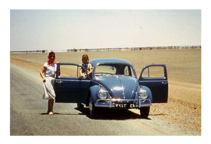
We reached the end of tarmac still very far of Port Sudan and saw the first real Fata Morgana

exams themselves. The internal exams would start on April 24th and continue after a short break with the external (British) part to end by May 20th 1962. Students could score up to 40 points during the study year and another 100 points from both exams thus making a maximum of 140 points. In principle a student would pass the year scoring at least 56 points of 20 points to collect throughout the year and the rest of 36 points from both examinations. About 30% were expected to have to reseat in August. The lecturers were able to maneuver the scoring system. Soon I would learn about more variations of how to combine student's score points from different exams so that he could pass the year. This scoring system was too frustrating for me as it opened doors to mishandling any score just to achieve an acceptable result in a class – the magic 30% number for re-examination. The student just should not lose a year!