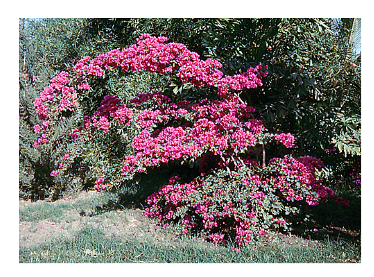
A Bougainvillea in full bloom at the Khartoum Botanic Gardens

Botanic gardens. I always wondered how fast Ljiljana would make contacts when talking to about the flora. She was a genuine Taurus woman, mind you! The terrace plants needed a constant attendance including watering them twice daily. The curtains had to be pulled shut soon after the breakfast and kept closed until late afternoon say 5 PM to preserve the plants. At nights curtains were pulled in and fixed securely until the next morning.