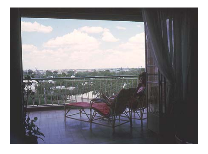
View from our dinning/living room at the terrace towards Khartoum South City

In April daily temperatures went over 40°C so the car body was warmer than the skin. Anything one put on, like shirts or underwear felt warm as the air temperature around them was warmer than the body temperature at all times now. The bed clothes likewise were warmer than one self and perspiration started instantly one climbed into bed. The constant perspiration meant that one drank one gallon of liquid daily. We drank literally gallons of black or hibiscus tea, avoiding soft sweet drinks which did not quench the thirst. One learnt that tepid drinks were more refreshing than cold. We stopped using the bathroom water heater since the water from the faucet was about 40°C too. Taking a shower became a cautious get in and out. Soon we learnt to fill the bathtub to brim and allow the intense evaporation to cool the water to a pleasurable temperature