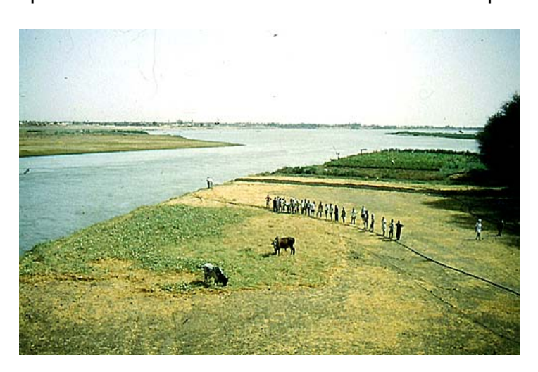
Mogrem Island at the confluence of White (left) and Blue Nile (from right) at low water level

the ground. The VW workshop solved the engine's after-running by exchanging original spark wires with much larger ones. Some people had chains or copper strips hanging down touching the road surface. In Khartoum one drove with open windows so that one could stretch out the right hand to indicate a change of direction as because of the bright light electric indicators were hardly visible. We learnt to be very careful not to touch the hot window frame as temperatures often exceeded 60°C if the car was parked in the sun.